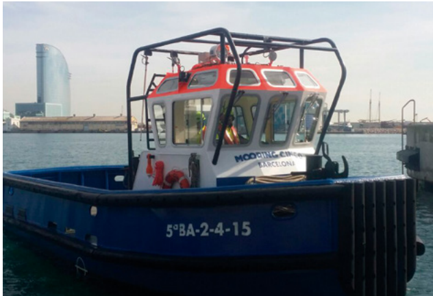
HARBOUR TUG TM-024-02