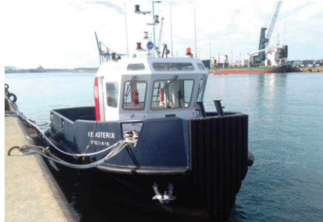
HARBOUR TUG TM-036-08