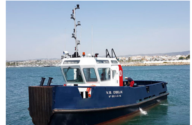
HARBOUR TUG TM-036-08